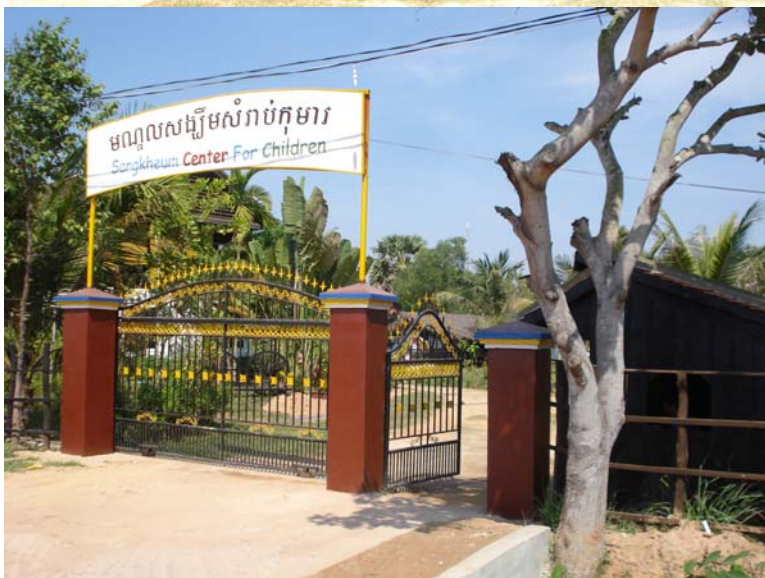
3. Entrance gate and guard post was Installed to enhance the security for the children and monitoring of visitors.