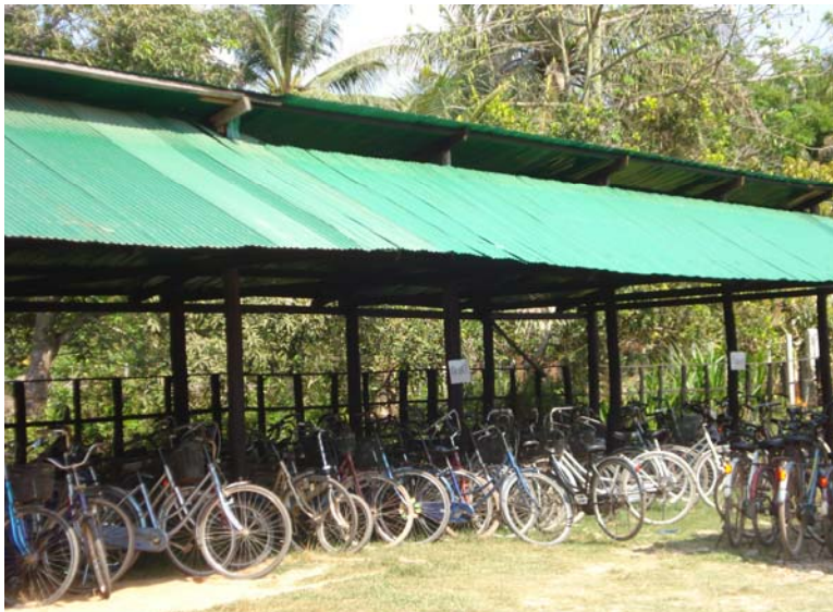
2. Bicycles parking house was enlarged to fit 150 bicycles.